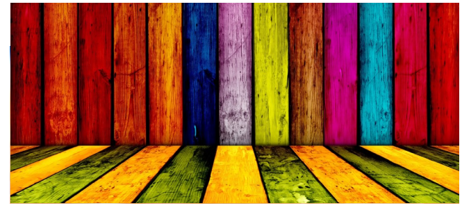
DCPS Attendance Brochure Updated August 2014